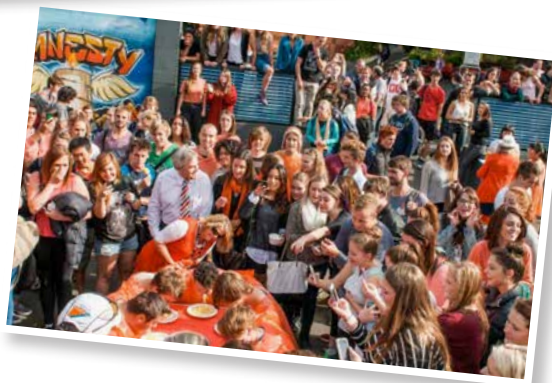
EC celebrates Harmony Day